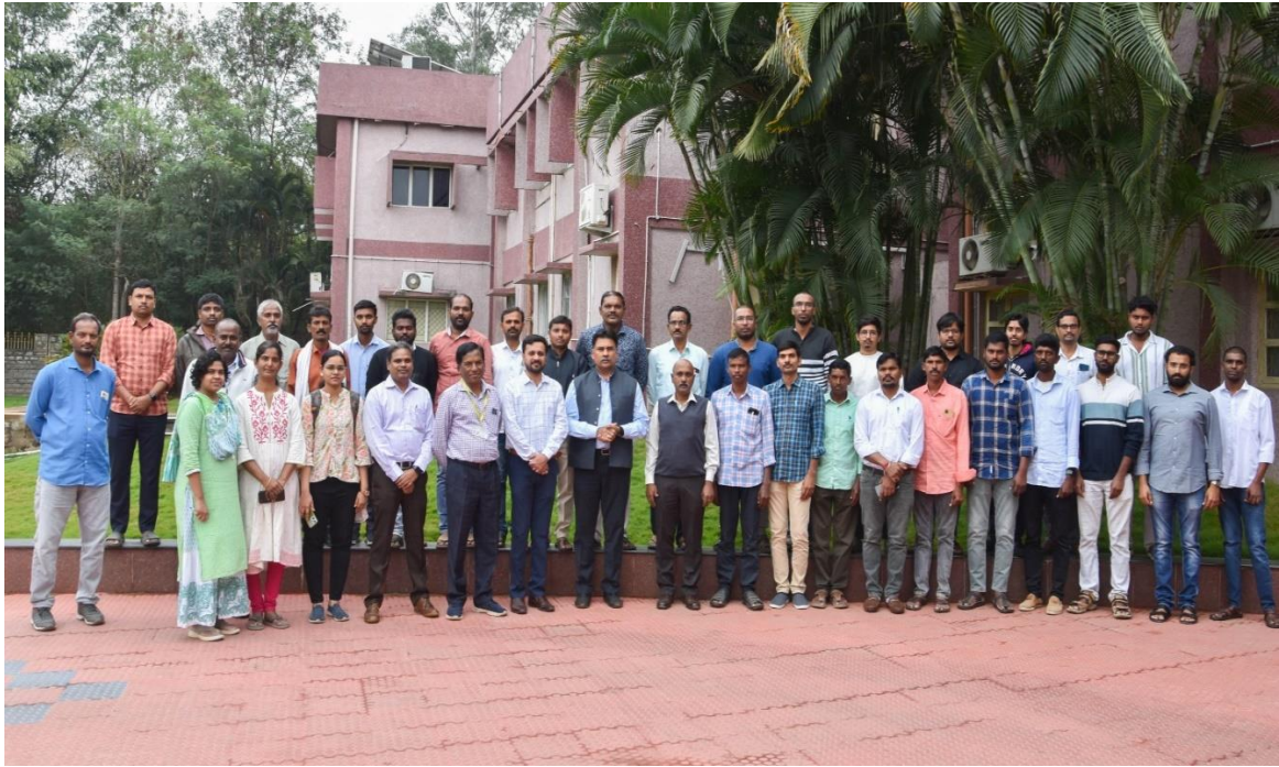
Participants group photo