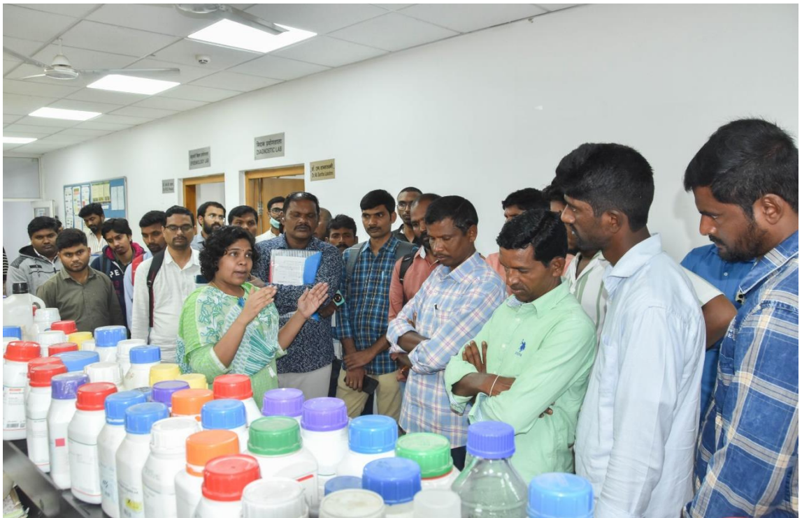
Visit of the participants to biopesticide and biofertilizer laboratory