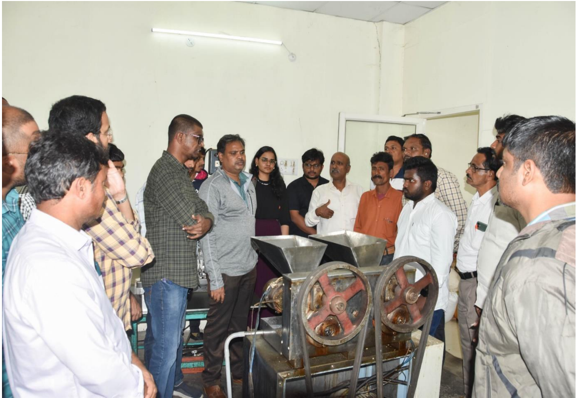
Visit of the participants to oil processing unit