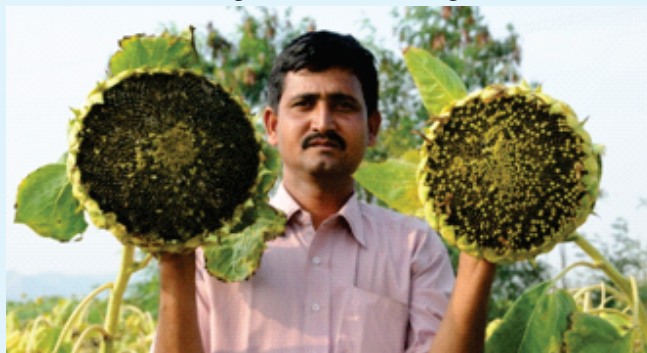
A farmer with bumper harvest of sunflower (DRSH-1)

Yield potential: Rainfed: 800-1000 kg/ha Irrigated: 2000-2500 kg/ha