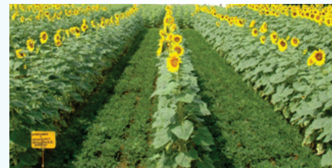
Groundnut + sunflower ICS

Intercropping systems (ICS): Pigeonpea + sunflower (2:1/1:1/1:2), groundnut + sunflower (5:1/3:1) and soybean + sunflower (2:1) are remunerative ICS.