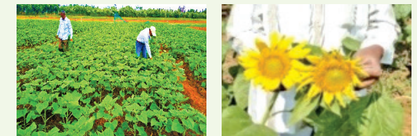
Roguing in seed production plot