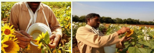
Collection of pollen from 'R' line and applying on 'A' line

Transfer of pollen: Begin pollinations in mid-morning with freshly collected pollen. Gently transfer pollen collected in bucket to exposed stigmas with a soft brush. Repollinate older stigmas with each successive pollination. Store pollen (4°C) if required for the next few days.